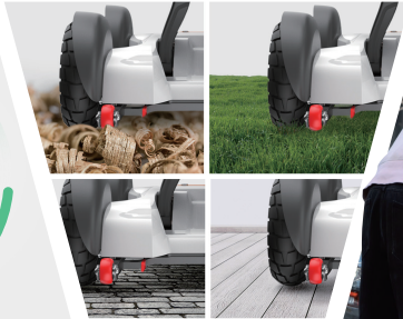
Omni-wheel built for rough terrain