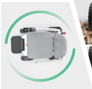
Tight turning radius