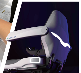
Built-in lighting for safety