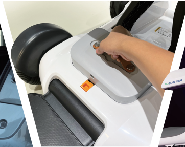
Removable lithium battery